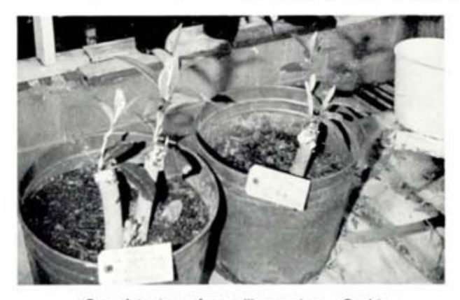
One of the joys of camellia growing - Grafting

Return those ugly shadow pictures. Get two more silver candelabras.