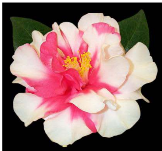
Frank Houser Var

Ack-Scent Campari Alba Plena Daikagura Alynnne Brothers Deanna J Anita Debutante Aspasia MacArthur Delores Edwards Aunt Jetty Donckelarii Ave Maria Dorothy Chester Betty Ridley Dryade Betty Sheffield Blush Supreme Edna Bass Bill Boll Elaine's Betty Black Gold Eleanor Hagood Black Lace Elizabeth Hunt Bobbie Fain Elizabeth Weaver Brooke Esther Smith Buttermint Finlandia Buttons 'n Bows Fircone Candy Apple First Blush Cardinal Richelieu Fran Homeyer Carter's Sunburst Frank Houser Cile Mitchell Freedom Bell