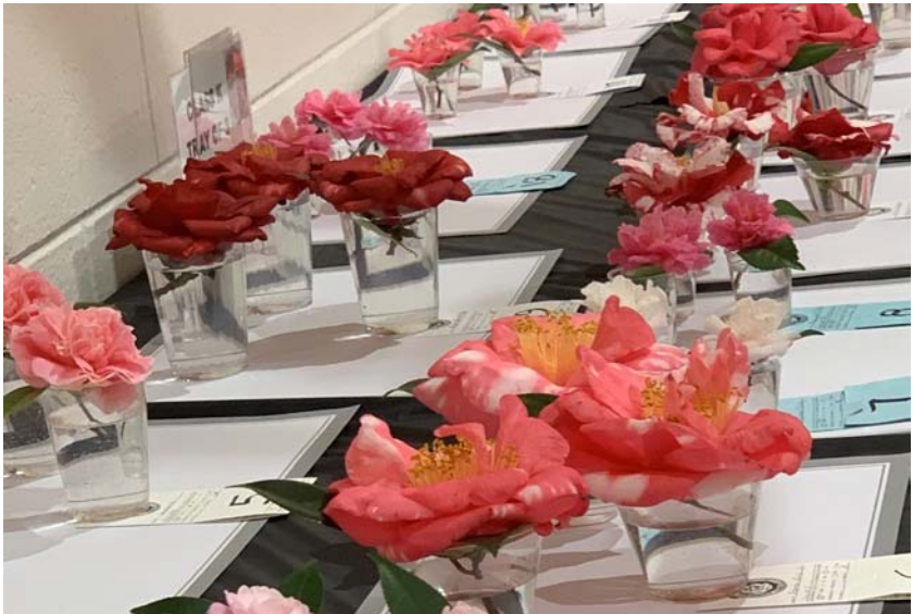
Beauties at the Aiken Show.