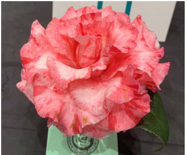
C. japonica 'Helen Beach'