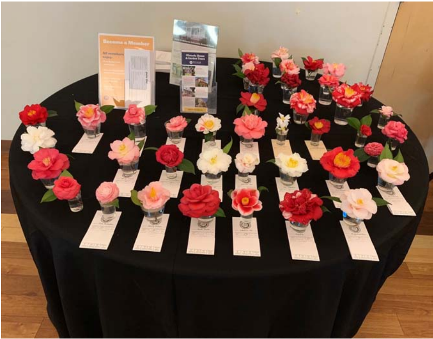
Historic Columbia's Display at Mid-Carolina Show.