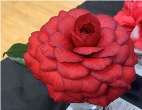
C. japonica 'Georgia Fire'