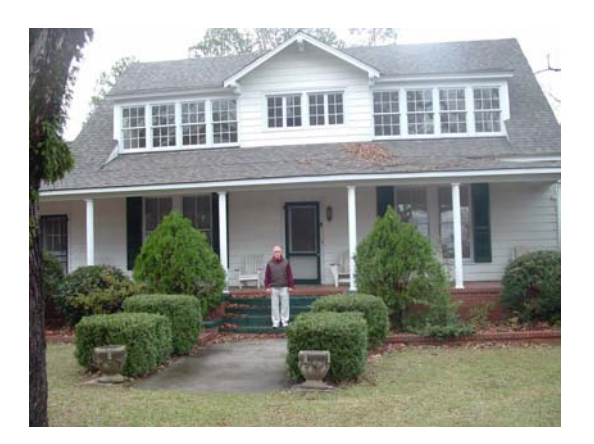
Jim Standing on Steps of Hephzibah Home

It consisted of named varieties of camellias, camellia seedlings and lots of native growth The native growth consisted of large briars, Cherry Laurel, Privet, Crepe Myrtle, Pomegranate, Pine Trees, Holly, Box Woods, Photinia and Podocarpus, to name a few. Now you see why the hedge was impenetrable. We put aluminum labels on 50 camellias camellia plants that were the major old varieties. There were: Daikagura, Pink Perfection, Debutante, White Empress, and Mathotiana, to name a few. We put the labels at eye height on a major branch where it could be easily spotted.