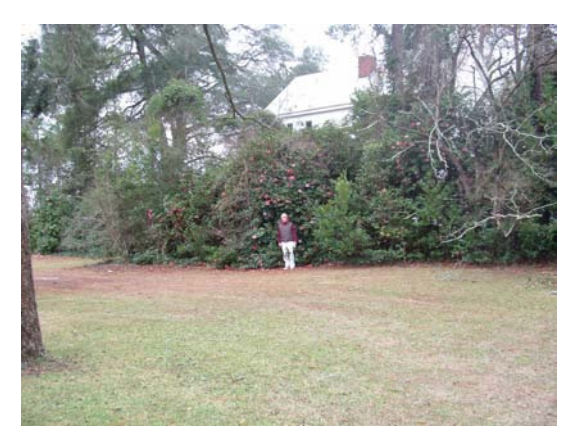
Camellia Hedge on Left Side of Home

It consisted of named varieties of camellias, camellia seedlings and lots of native growth The native growth consisted of large briars, Cherry Laurel, Privet, Crepe Myrtle, Pomegranate, Pine Trees, Holly, Box Woods, Photinia and Podocarpus, to name a few. Now you see why the hedge was impenetrable. We put aluminum labels on 50 camellias camellia plants that were the major old varieties. There were: Daikagura, Pink Perfection, Debutante, White Empress, and Mathotiana, to name a few. We put the labels at eye height on a major branch where it could be easily spotted.