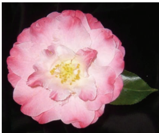
Mutant from Spring Daze