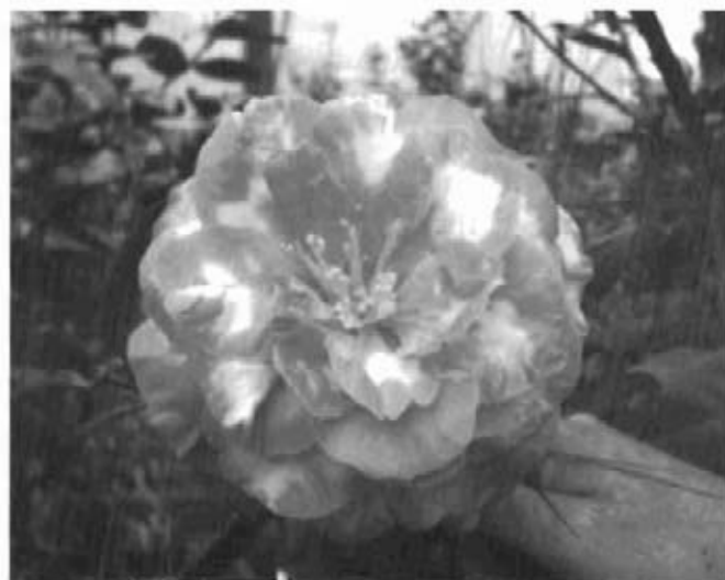
C. japonica Rosea Superba Var. Antique (1890)

I cannot think of anything a rose person might have that a camellia person would be jealous of—except—the most beautiful blooming flower in summer with enviable fragrances which few flowers will ever equal.