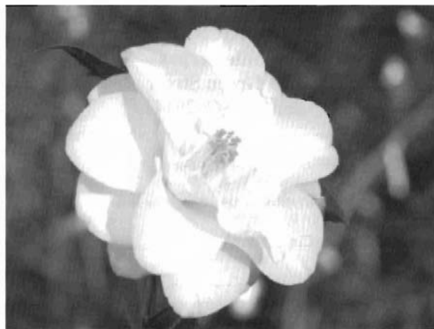
C. japonica Magnoliaflora Antique (1886)

Encourage members to endow trophies and local clubs to honor themselves, their firm, friends or family members. I think many clubs would change their names to the "John or Jane Doe Camellia Club" for a gift of $25,000 from which interest could be used for show and club support.