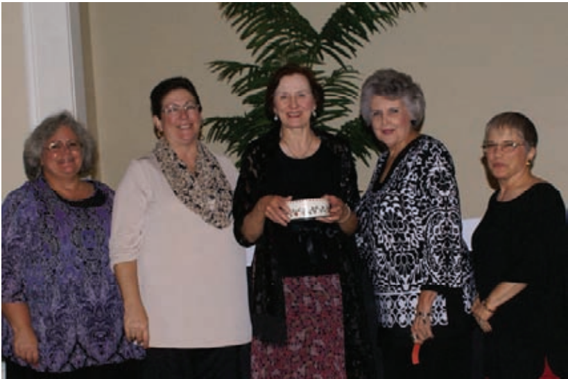
Convention raffle presenters and winners.