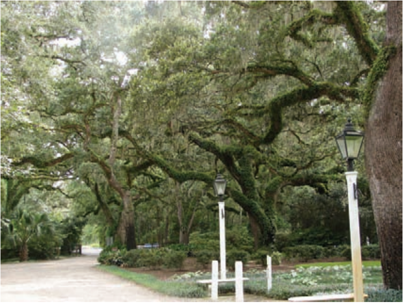
Oak Trees lining the lane—Eden Gardens State Park.